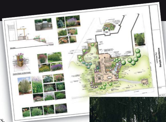
Sample projects from Cooperative Design Resource, which serves the Denver Metro area.